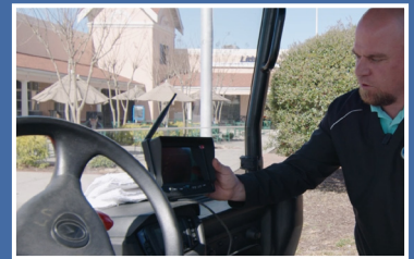
BACK-UP CAMERA SYSTEM FOR ADDED SAFETY