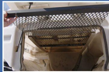
REMOVABLE HOPPER SCREEN FOR EASY CLEANING