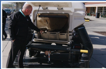
THREE-PIECE BIN SYSTEM FOR EASY DEBRIS REMOVAL