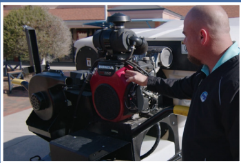
POWERFUL SWEEPING ENGINE WITH 7 GALLON FUEL TANK