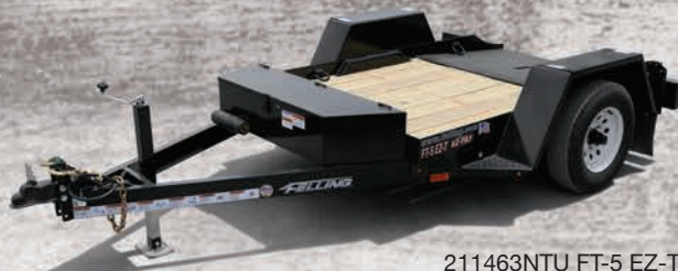
211463NTU FT-5 EZ-T

Towing Deck Height • FT-5 EZ-T 19.5" • FT-7 EZ-T 20.5" • FT-12 EZ-T 20.5" with a 5° Load Angle