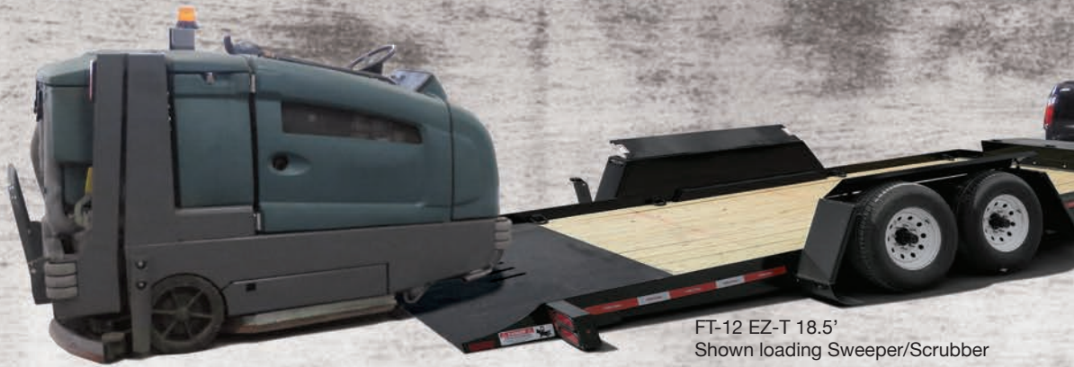
FT-12 EZ-T 18.5' Shown loading Sweeper/Scrubber