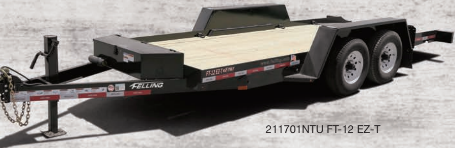
211701NTU FT-12 EZ-T

Rotating Torsion Suspension with Hydraulic Self Locking (No extra pins or locks required)