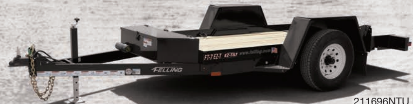
211696NTU FT-7 EZ-T