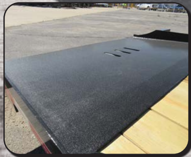
3'-3.5' Approach Plate With Anti-Skid Paint