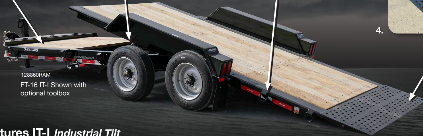
128860RAM FT-16 IT-I Shown with optional toolbox