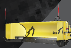
QuattroPlow® 6,000-10,000 lbs.