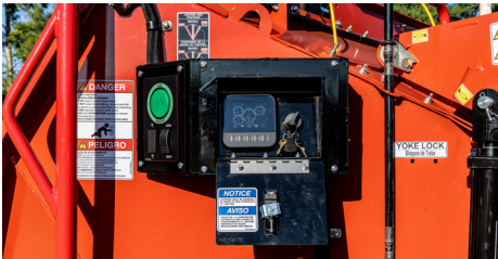
Infeed-Mounted Control Panel