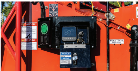
Infeed-Mounted Control Panel