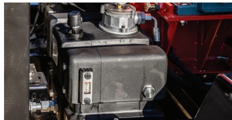
Composite Fuel and Hydraulic Tanks