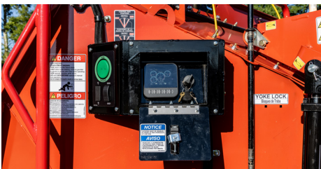
Infeed-Mounted Control Panel