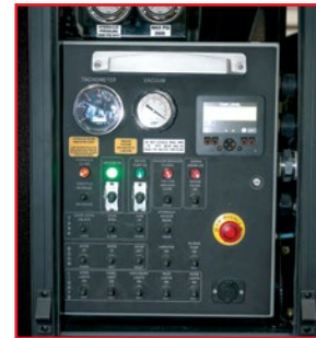
Main Controls with E-Stop