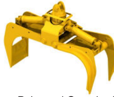
Bypass Pulpwood Grapple shown with 360° Indexator Rotator

We offer a wide variety of attachments including: