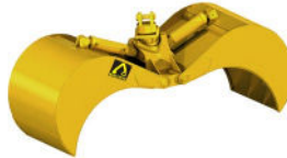
Municipal Waste Grapple shown with 280° Rotator