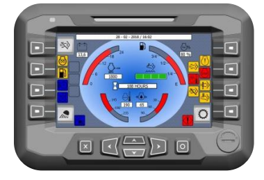
Optional color screen

In the event of a clutch failure, a lever allows for its manual activation to let you finish the job.