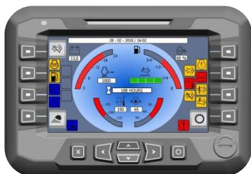
Optional color screen